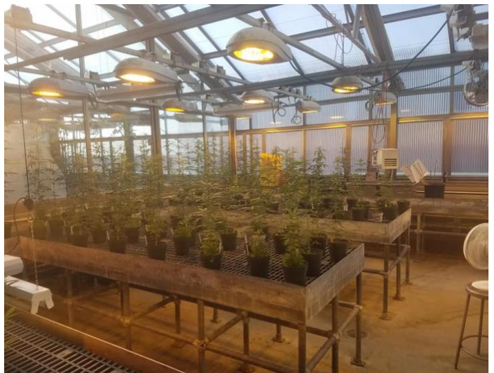
Cannabis (hemp) growing in the UWSP greenhouse, spring 2020 (image: B. Barringer)